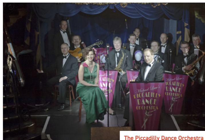
The Piccadilly Dance Orchestra