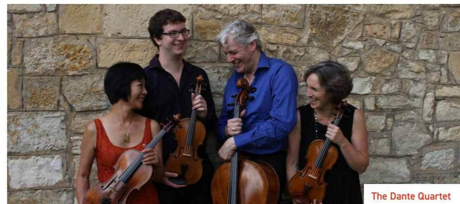
The Dante Quartet