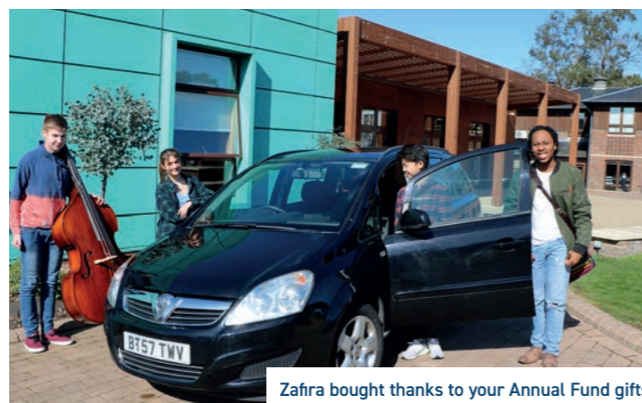
Zafira bought thanks to your Annual Fund gifts