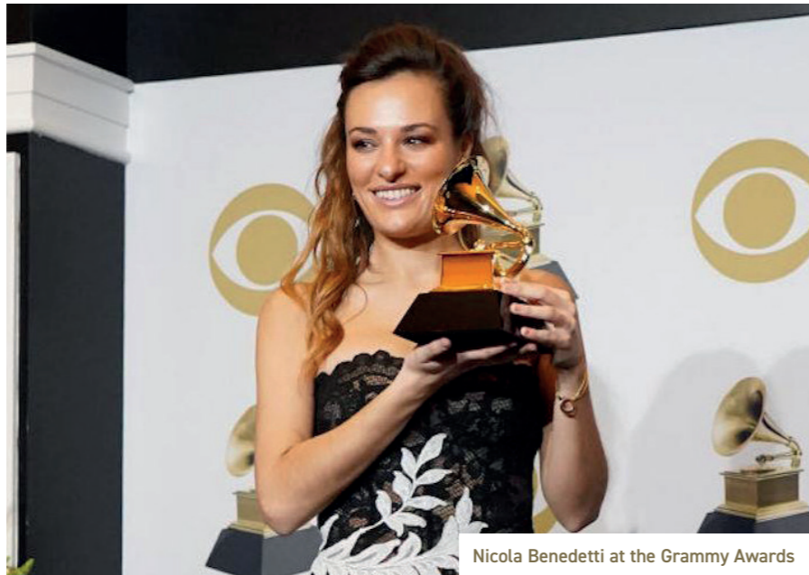
Nicola Benedetti at the Grammy Awards

Nicola Benedetti won Best Classical Instrumental Solo for her latest recording Violin Concerto; Fiddle Dance Suite at the 62nd annual Grammy Awards. The album features two new pieces written especially for her by American trumpeter and composer, Wynton Marsalis: Violin Concerto in D and Dance Suite for Violin Solo . The latter was recorded in our very own Menuhin Hall in March of last year. Nicola also performed Violin Concerto in D at the ceremony with The Philadelphia Orchestra under the baton of Cristian Măcelaru.