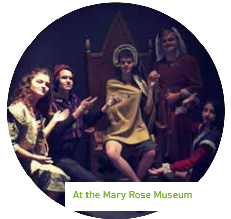
At the Mary Rose Museum

All of the outings provided opportunities for the pupils to unwind after the busy weeks of exams and performances, and a great time was had by all.