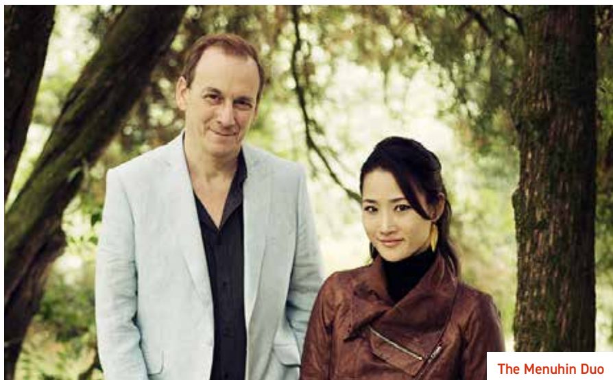
The Menuhin Duo

Those audience members who were lucky enough to get a ticket to the sold-out Orchestral Picnic Concert were treated to an absolute feast of orchestral gems, with the little-performed Schubert Death and the