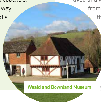
Weald and Downland Museum

his steps in the Sand Walk which he used to do every day to improve his health. A highlight of the visit was the greenhouse in which there were many exotic plants including Venus fly traps, Sarracenia psittacina and Drosera capensis . A great way to spend a day.